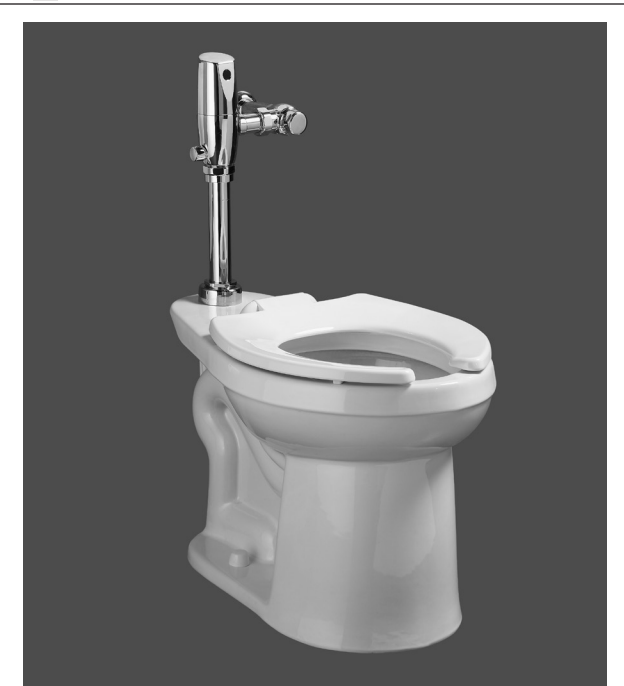
1" N.P.T. OR 1" C.W.T. SUPPLY TO FLUSH VALVE –

ADA MEETS THE AMERICANS WITH DISABILITIES ACT GUIDELINES AND ANSI A117.1 REQUIREMENTS FOR ACCESSIBLE AND USABLE BUILDING FACILITIES - CHECK LOCAL CODES.