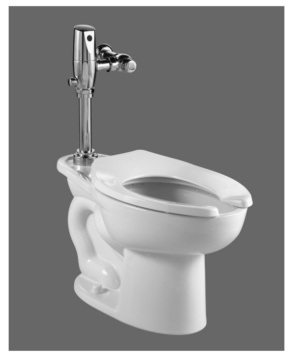
SEE REVERSE FOR ROUGHING-IN DIMENSIONS

ASME A112.19.2 / CSA B45.1 for Vitreous China Fixtures