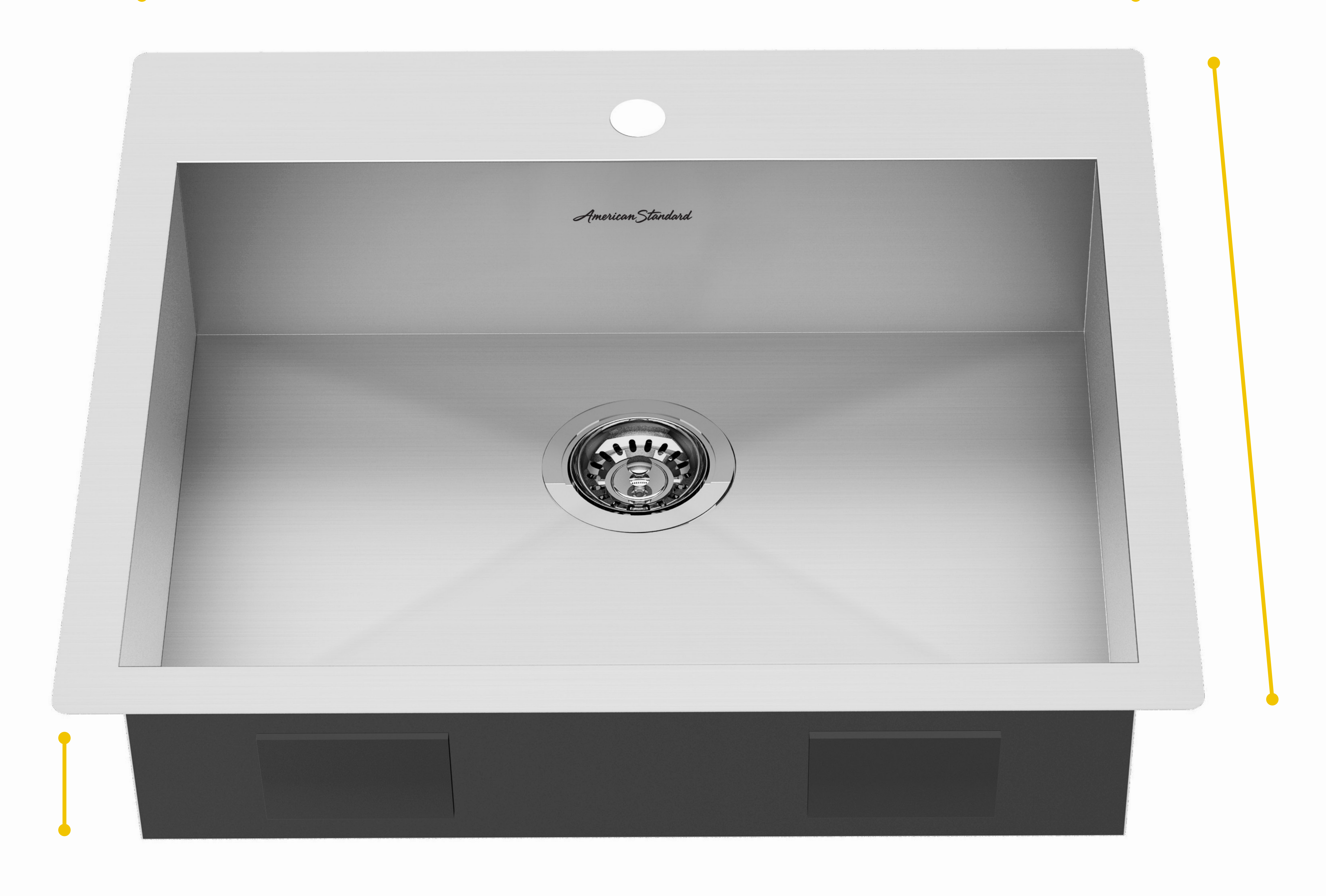
Depth 6" (152 mm)